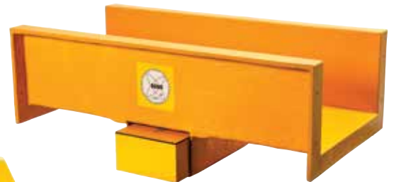
Custom made fiberglass section with A10 Search Coil