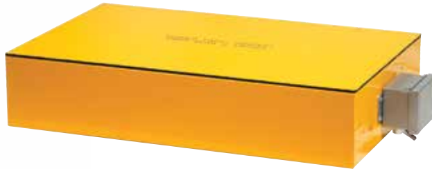
A20 Under Conveyor Search Coil

New high powered hand-held, weather resistant, adjustable and ergonomic