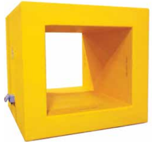
A50 High powered CANT Log Search Coil