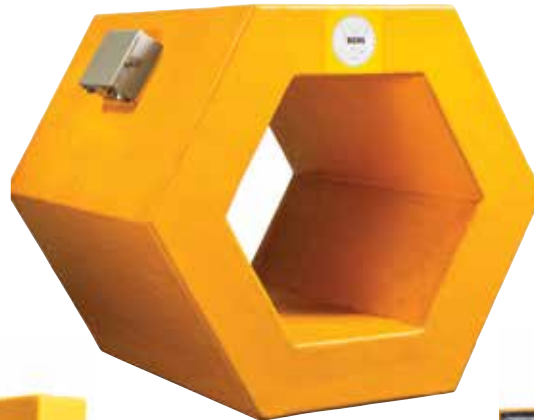
A60 Whole Log Search Coil