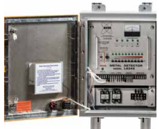
LS345 High Powered Control Unit