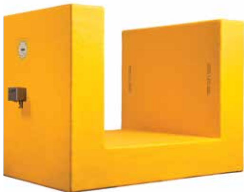
A30 U Search Coil for finding tramp metal in pulp logs